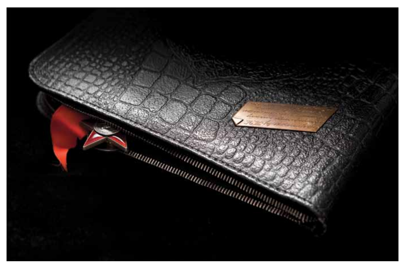
↑ "Dad had to work in the military, which controlled every moment of his life. His proudest moments were on Victory Days, when he would take out a black leather folder and show my sister and I his medals. My favorite one was the sharp-cornered Order of the Red Star, which depicted a little figure of a soldier with a rifle. It had the third highest ranking in military orders and was awarded for military action. Dad was very proud of it, though he never told us what act he received it for-veterans didn't really like to talk about the war."