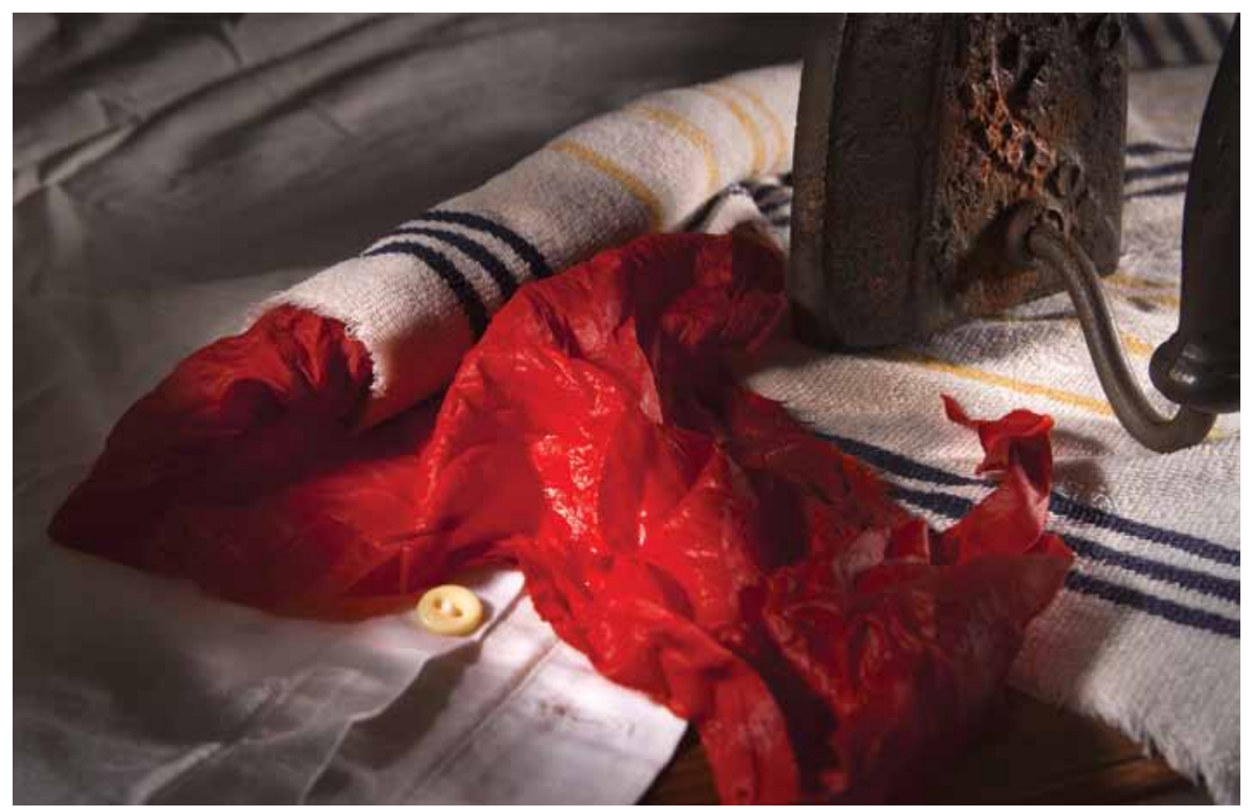
*Red Pioneer Tie. First, you wash it. Then, you roll it into a towel to wring out as much water as possible. Finally, you iron it. Every day, before school."