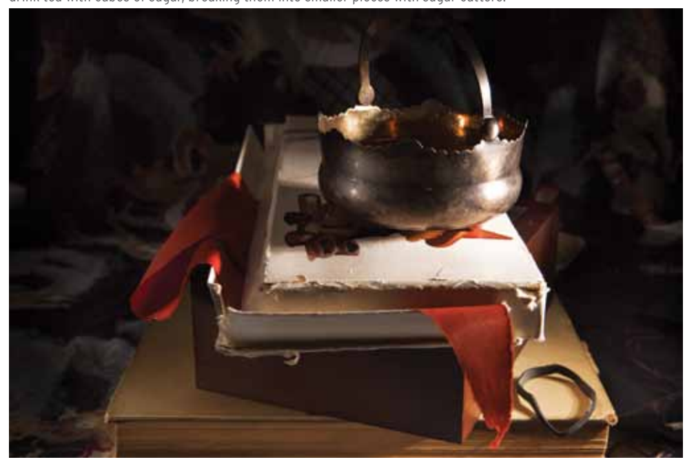
↑ "Dad would save every box from boxed chocolates. He used them to store documents, letters, and photographs. As they would lose their shape with time, he would mend their corners and use black rubber bands to hold the lid in place."