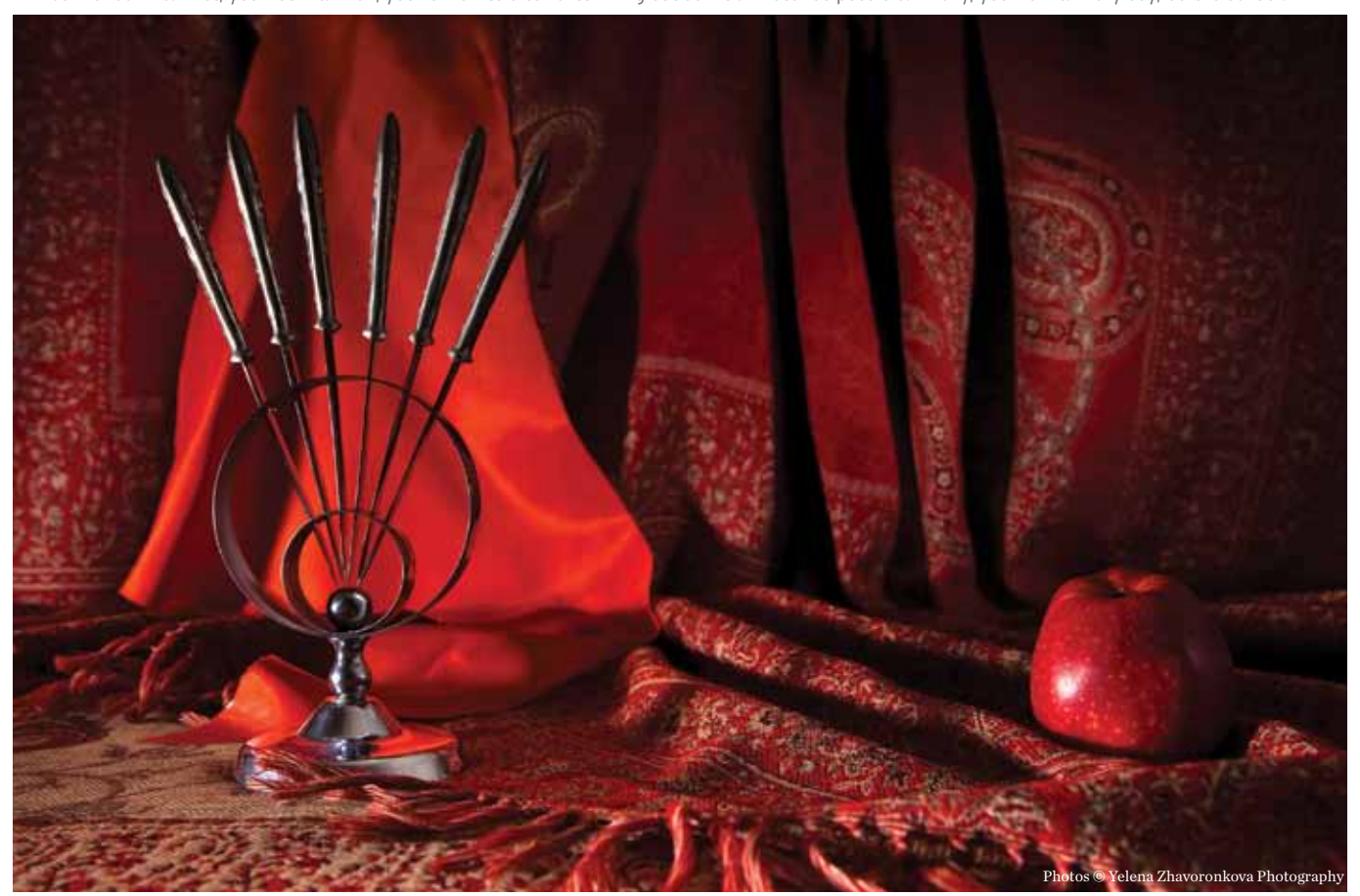
↑ "My dad liked to peel an apple into his tea. This was his version of fruit flavored tea, long before we were introduced to the packets of various flavors."