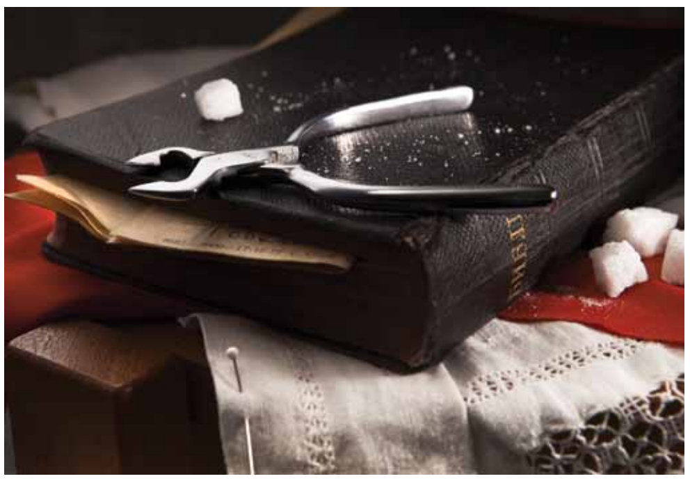
↑ "This old bible, set in pre-reform Russian orthography, was the only book my grandma owned. She liked to drink tea with cubes of sugar, breaking them into smaller pieces with sugar cutters."